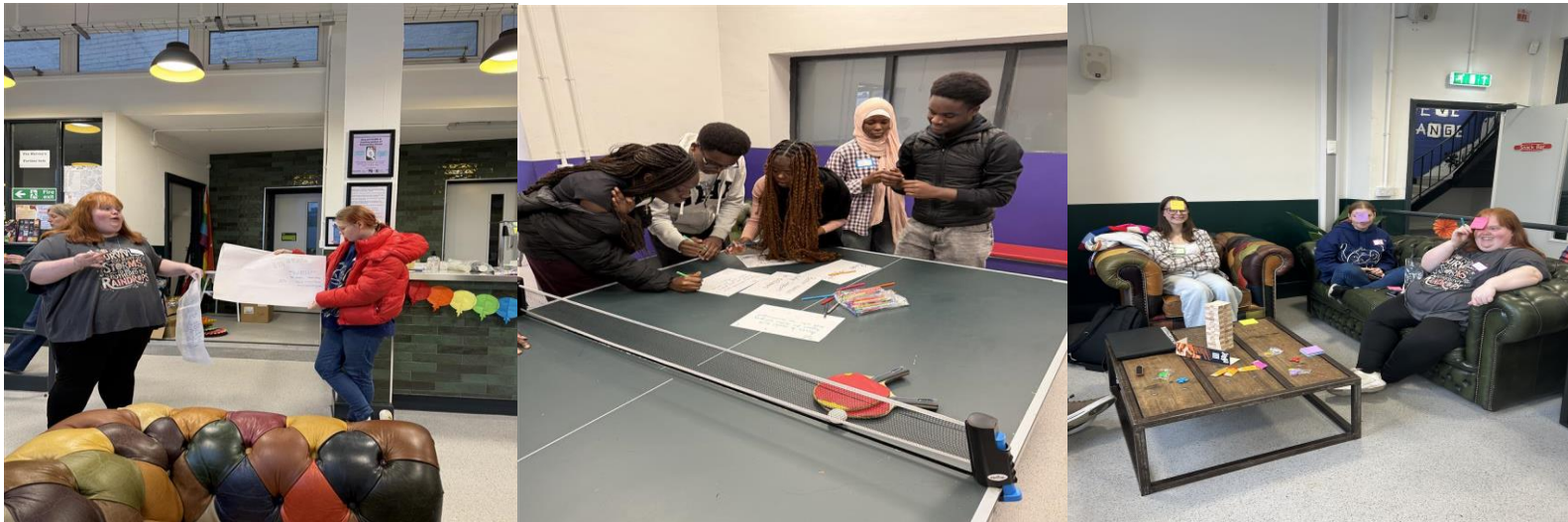
Photos from a recent Hull & ER NAUWU session