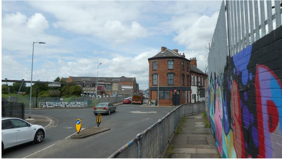
Figure 4 - Early 20th buildings at junction of Wincolmlee & Lincoln Street, including Bay Horse.