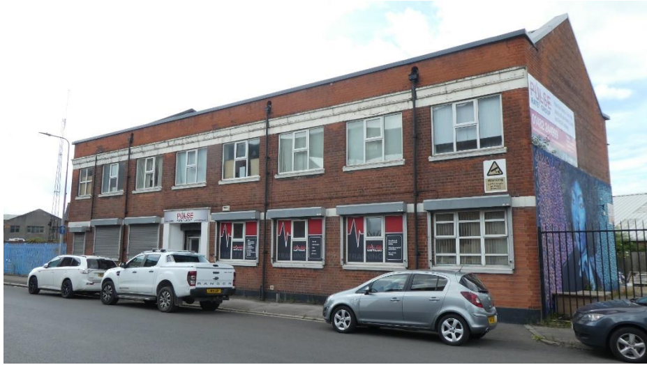
Figure 7 Pulse - 1950s Warehouse