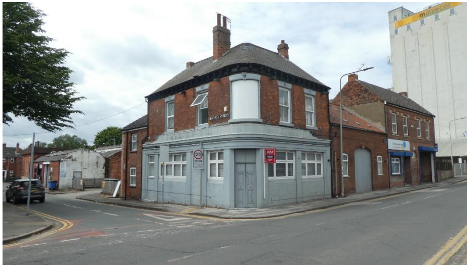
Figure 1 - Former Bay House and adjoining early 20th century buildings.