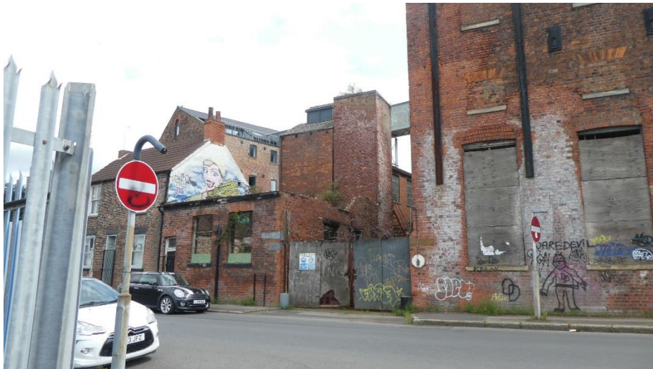
Figure 5 - 196 Wincolmlee - Grade II