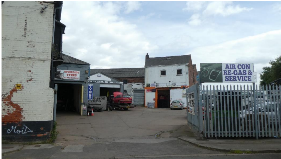
Figure 10 - 19th Century buildings to rear of No.260.