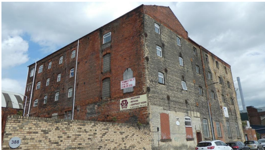
Figure 12 - 386 Wincolmllee. 19th century warehouse. Not designated.