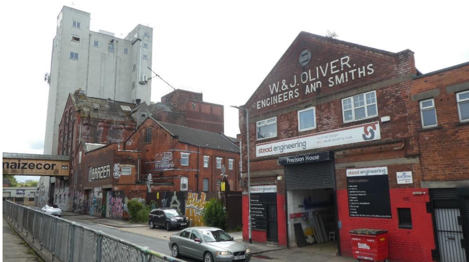
Figure 2 - Late 19th/early 20th Century Maizecor Mill & Engineer works - not designated.