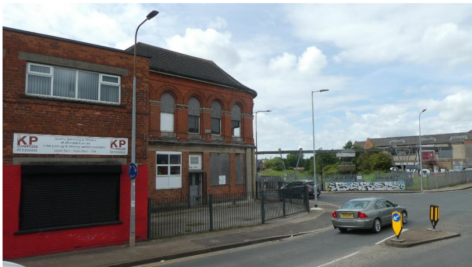
Figure 3 Central Buildings, No.1 Green Lane - Local List