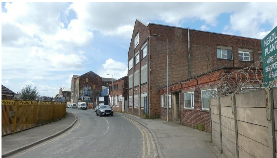
Figure 11 - No.328 Wincolmllee (Not designated).