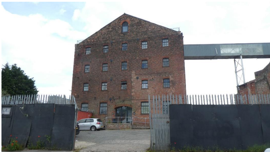
Figure 6 - High Flags - Grade II