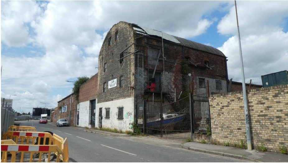
Figure 13 - No.388 Wincolmllee. 19th century warehouse. Not designated.