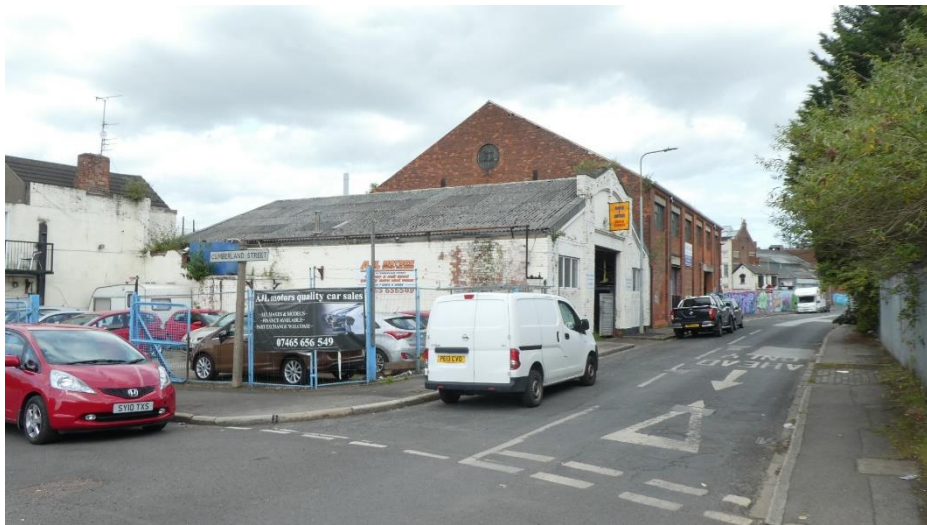
Figure 8 No.205 & Fast Glass, Wincolmlee - Late 19th /early 20th buildings - No designation.