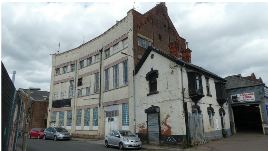
Figure 9 - Warehouse & Cottage, No.260, Wincolmlee – Hull Local Heritage List.